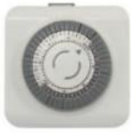
Mechanical Timer GR-MT