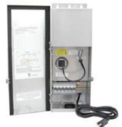
Transformers 300W / 600W GR-TR300W / GR-TR600W