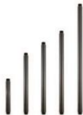
Extension Threaded Rods GR-EXT 6/12/15/18/24 (inches)