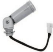
Plug In Photocell GR-PC