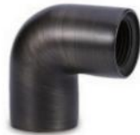
Brass 90 Degree Elbow GR-90