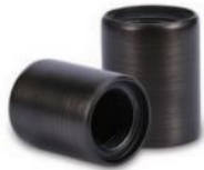
Brass Riser Connector GR-BR