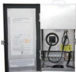
Transformers 100W / 150W GR-TR100W / GR-TR150W