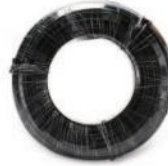
100FT 12/2 14/2 16/2 AWG GR-100 / 12/2 / 14/2 / 16/2 /