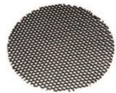
MR16 Louvre Lens GR-HLPAR36