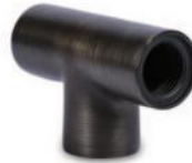
Brass T Connector GR-TC