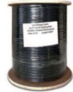
500FT 12/2 14/2 16/2 AWG GR-500 / 12/2 / 14/2 / 16/2 /